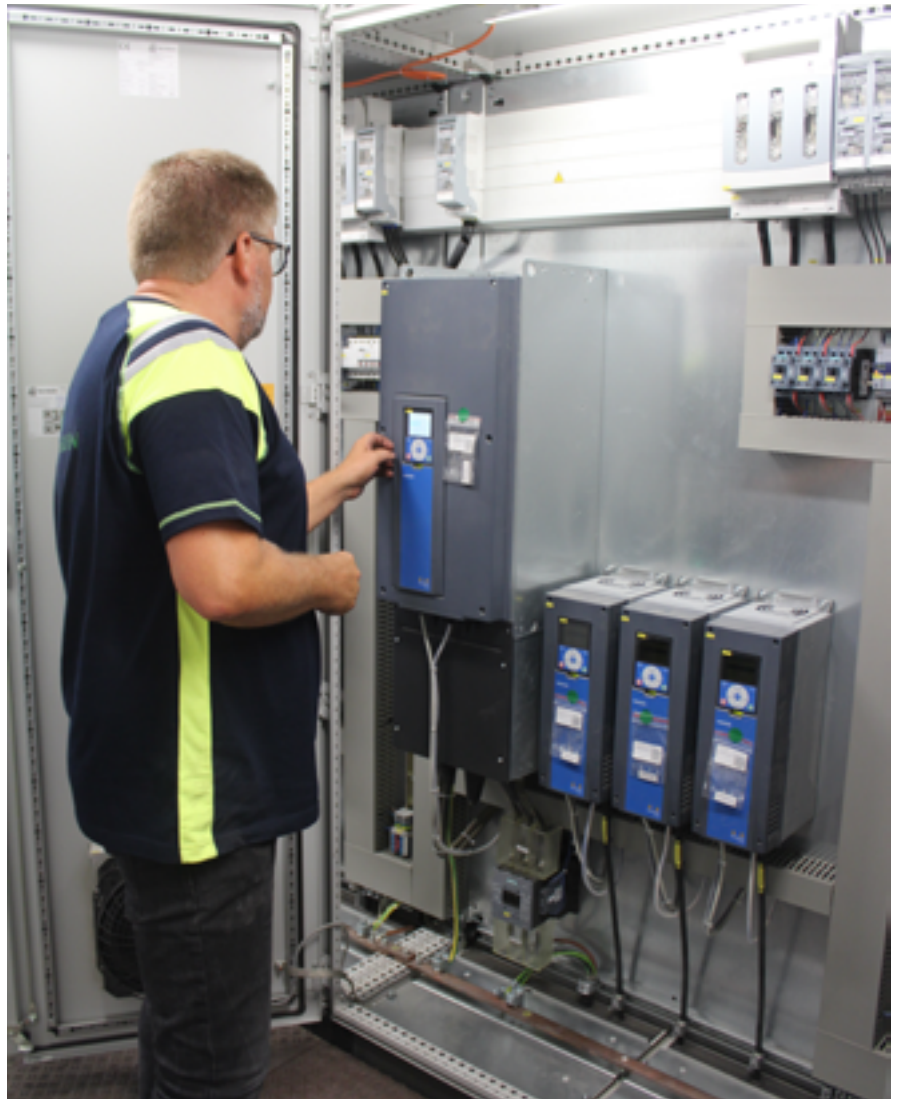
Danfoss Drives' VACON® 100 was supplied by Bilfinger directly from Germany, mounted in a container, ready for use when the plant was commissioned in April 2018.

At the Kalundborg plant, the biogas is purified to the same quality as the natural gas and therefore can be stored for distribution in the Danish natural gas grid. The "raw" biogas contains 60% methane—the rest is CO 2 and hydrogen sulfide. In the post-treatment plant, the gas is cleaned to 99% pure methane. The sulfur bonds turn into sulfuric acid, which is added to the residual product as fertilizer. CO 2 may potentially be sold to other customers in the future.