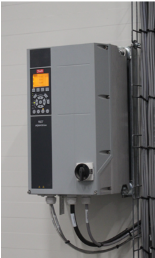
VLT® AQUA Drive FC 202 controls pumps and blowers at the large biogas plant.

The facility is built in an area near the Asnæs plant on a diked-in seabed that is filled with slag from the Danish power plants, which is good use of the slag material.